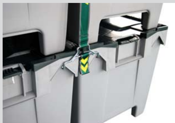
Hook secures boxes as one unit load