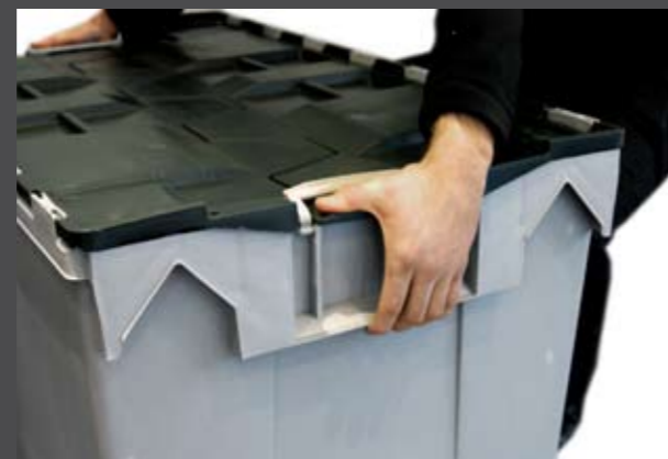
Handles for easy stacking and movement by hand