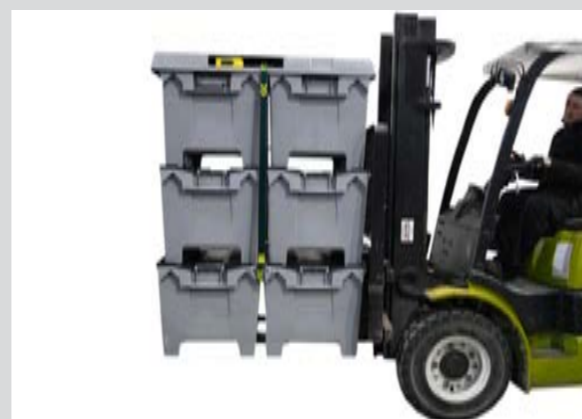
Six loaded boxes handled in one movement