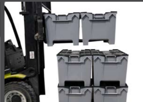
Stackable when loaded