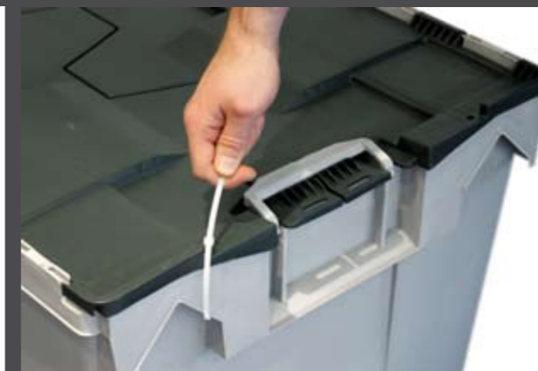
Lockable lid for complete product security