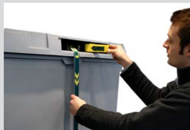
Simple ratchet in lid to tension and release load