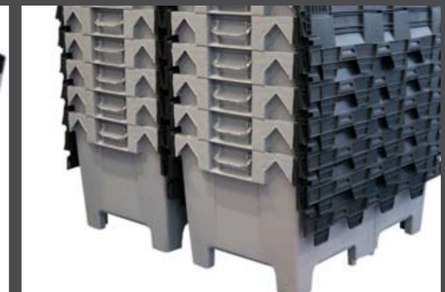
Nestable when empty