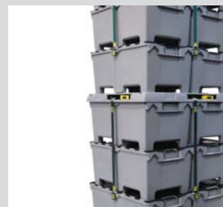
Location points for secure double stacking in storage/transit