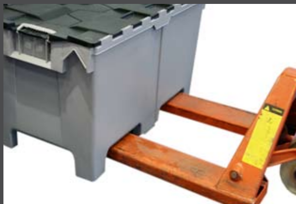
Pallet feet built in to box to allow handling by forklift, pump truck or lifter

Highly efficient product picking, handling and replenishment