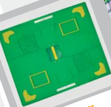
UK LID IN USE